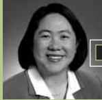
State Senator Mee Moua

By winning 60 percent of the vote in 2002, State Senator Mee Moua became the first Hmong-American state legislator in the nation. Born in war-torn Laos in 1969, she escaped to Thailand with her family at the age of five and lived in a refugee camp before resettling in the United States in 1978.